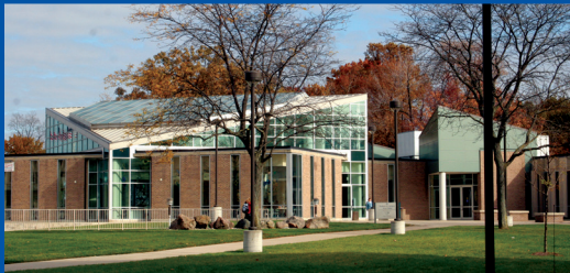
Henry Ford College is located at 5101 Evergreen Road, between Michigan Avenue and Ford Road, in Dearborn.

5101 Evergreen Road Dearborn, Michigan 48128 1-800-585-HFCC (4322) hfcc.edu